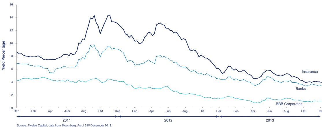
Insurance, BBB-Corporate and Bank Bonds Ask - Yields 2011 - 2013

high compared to levels seen prior to the financial market crisis. Investors who do not need highly liquid investments, such as pension funds and life insurance companies, will seek to capture attractive illiquidity premiums.